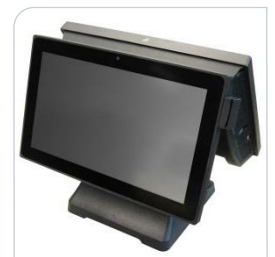
14.1 inch 16:9 LCD customer display