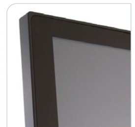
Zero edge bezel