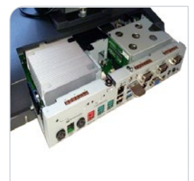
Slide in / out mother board

Specifications are subject to change without notice - © AURES 2016