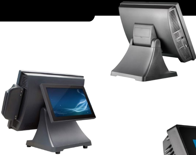
Dual screen system